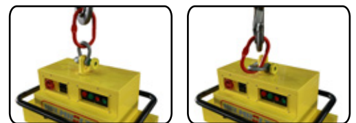
The specially designed sensor ensures the lifter can be DEMAG only when the load is well secured HSS (Helmholtz safety system)